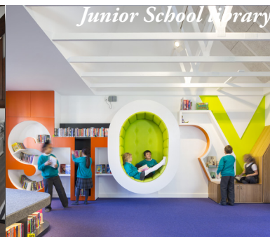
Junior School library