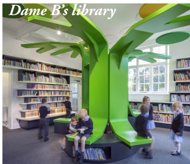
Dame B's library

From creating the 6th Form College, through to development of the inspiring Visual Arts Centre, Hall and Dining Room in the Senior School and the award-winning learning spaces of Dame Bradbury's, the Junior School and the Pre-preps - we have continued to contribute to the delivery of the exceptional education your children receive here at the Foundation, through innovative building projects.