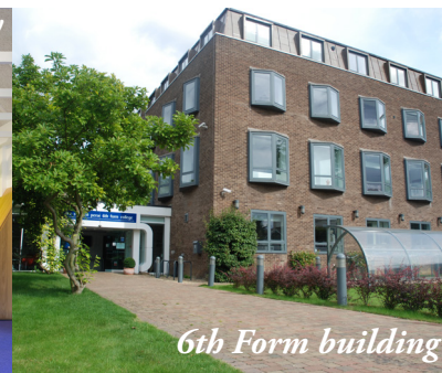
6th Form building