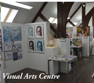
Visual Arts Centre