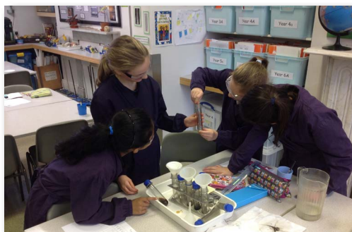
Year 4 filtering