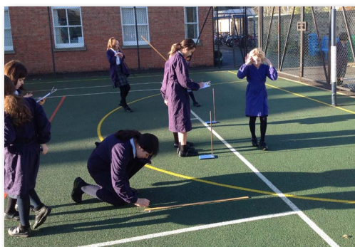
Year 5 shadows