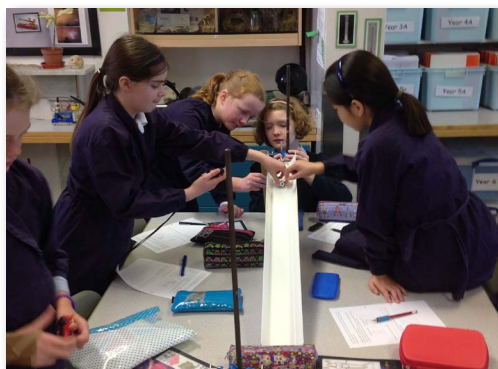
Year 6 forces