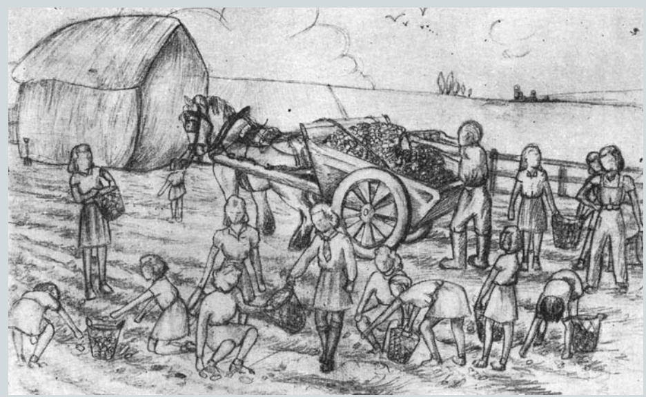
From The Persean magazine, 1940