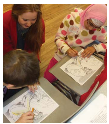
Local state primary schools partnered with our students in our first 'Serious Fun on Saturday' workshop.

Social engagement is becoming an increasingly important part of our work at the SPF. The SteP Out (Stephen Perse Outreach) programme has been inaugurated to promote social engagement at every level of the Foundation.